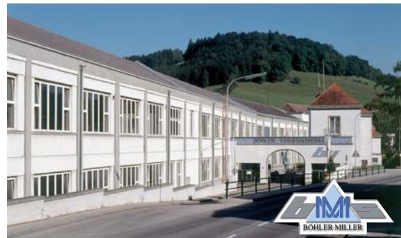
Böhler-Miller Messer- u. Sägen GmbH, Böhlerwerk

Sales & Production Waidhofner Straße 11 A-3333 Böhlerwerk Austria T: +43 (0) 7442 / 601 - 0 F: +43 (0) 7442 / 601150 E-mail: info@bmms.at www.bmms.at