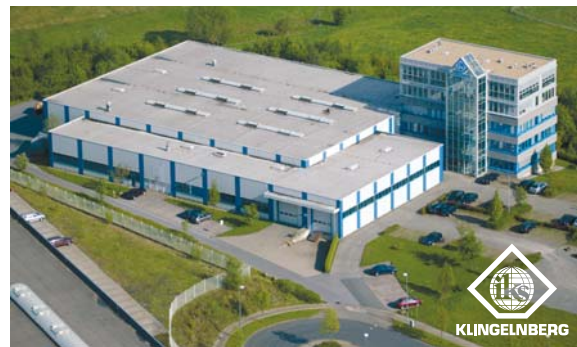
IKS Klingelberg GmbH, Remscheid

Headquarters & Sales In der Fleute 18 D-42897 Remscheid Germany T: +49 (0) 2191-969-0 F: +49 (0) 2191-969-111 E-Mail: info@interknife.com www.interknife.com