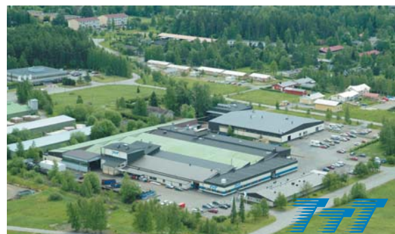
TTT Technology Oy AB, Toijala

Sales & Production Jokiniementie 20 37800 Toijala Finland Telefon: + 358 201 240 288 Telefax: + 358 201 240 371 E-Mail: ttt.sales@tttgroup.com www.tttgroup.com